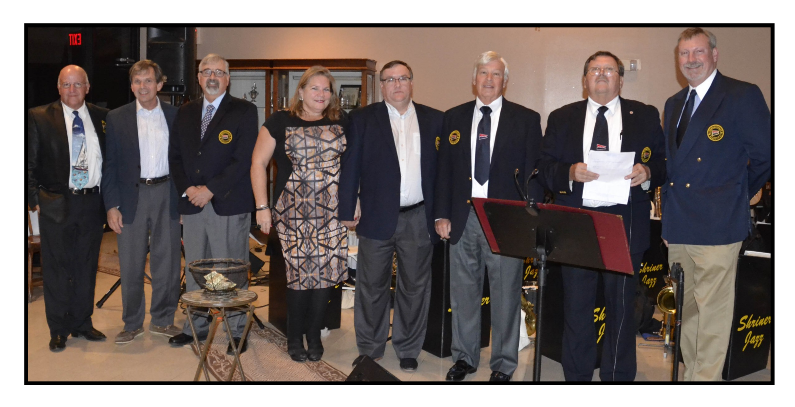
The 2016 Board of Directors at the CSA Birthday Party